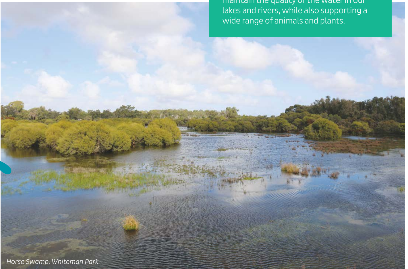
Horse Swamp, Whiteman Park

Most wetlands in WA are seasonally wet. Those that receive water from groundwater tend to stay wet longer throughout the year, but when groundwater levels drop through overuse or climate change, wetlands can suffer and deteriorate. This is a concern as wetlands are an important way to maintain the quality of the water in our lakes and rivers, while also supporting a wide range of animals and plants.